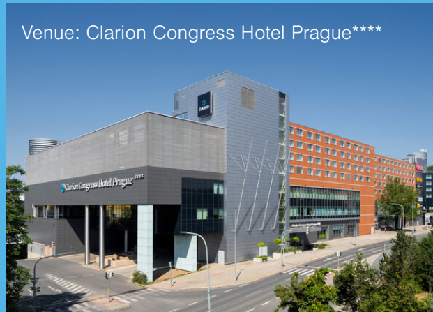
Venue: Clarion Congress Hotel Prague****

The ETCC 2026 will take place at the Clarion Congress Hotel Prague , a modern and fully equipped venue offering a perfect setting for an international scientific and industry event. Located in the heart of Prague, the hotel provides excellent accessibility and comfortable accommodation. The venue is well-connected to public transportation, allowing attendees to explore Prague's rich cultural heritage.